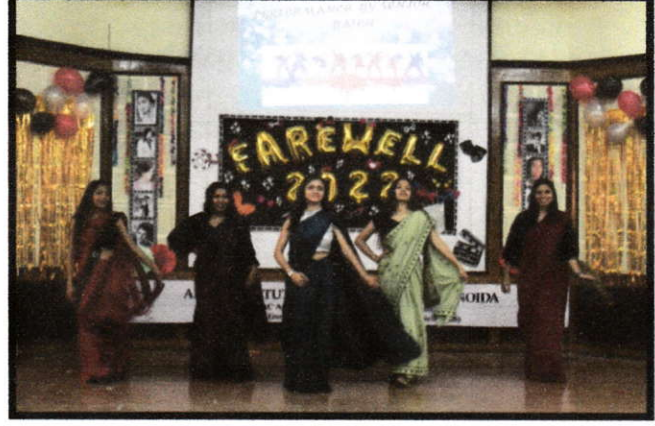
Performances by Junior and Senior Batch Students